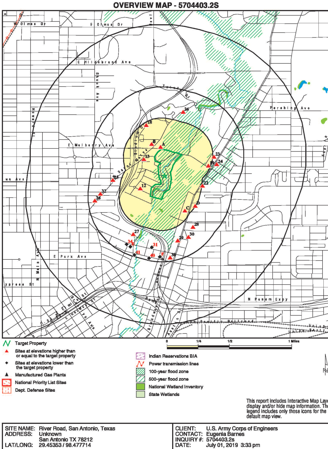
Figure 2: Map of River Road HTRW Sites