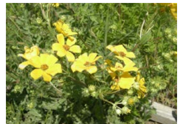
Engelmann's (cutleaf) daisy, April 2013, Wetland Cell F

Project status: The city of Dallas assumes management of the wetlands when the U.S. Army Corps of Engineers completes each section. It will be a public natural area for light recreational use (hiking, birding and bicycling).