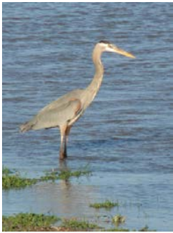
Great blue heron, 2012, Wetland Cell F

Public Access Parking Lot Entrance off Great Trinity Forest Way (Loop 12)