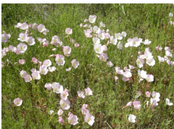
Pink evening primrose, April 2013, Wetland Cell F

Construction history: The federal project began in 2004 with the excavation of Wetland Cell D (next to the I-45 Trinity River Bridge); plantings began in 2005. Excavation of Wetland Cells E, E-West, F-North, F&G were completed in 2008 across a landfill and a golf course. Revegetation in this Lower Chain is complete. Excavation of the adjacent Upper Chain of Wetlands (Cells A, B&C) just upstream is under way with revegetation to follow. Completion target: 2018.