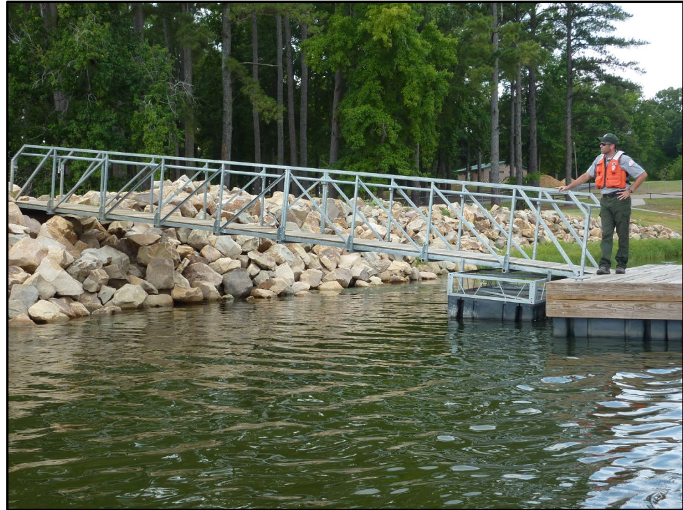
Public Recreation Area