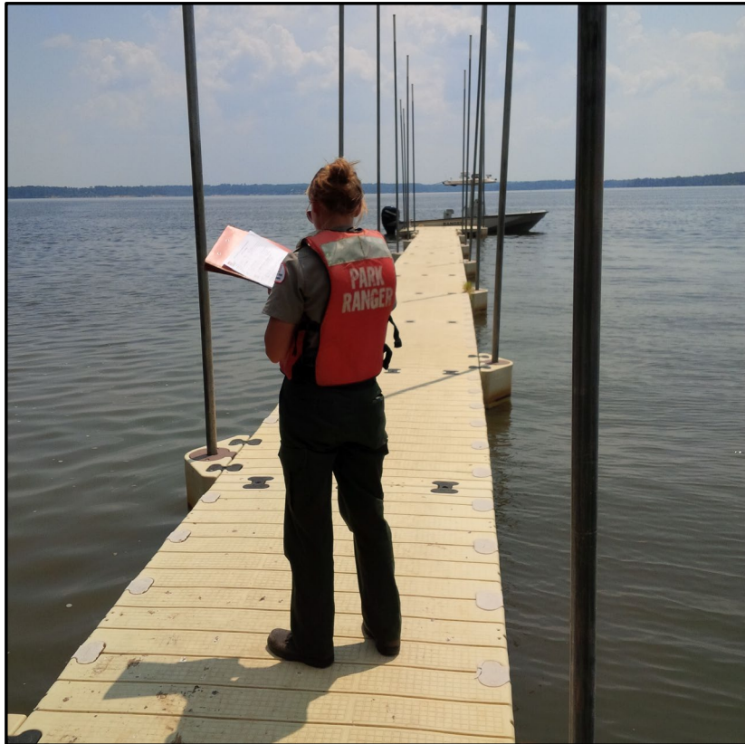
Limited Development Area