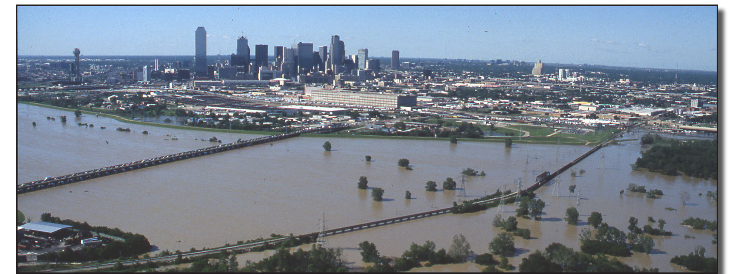
1990 Flood - Largest Flood Event Since 1908