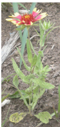
Indian blanket seeded at Cell A