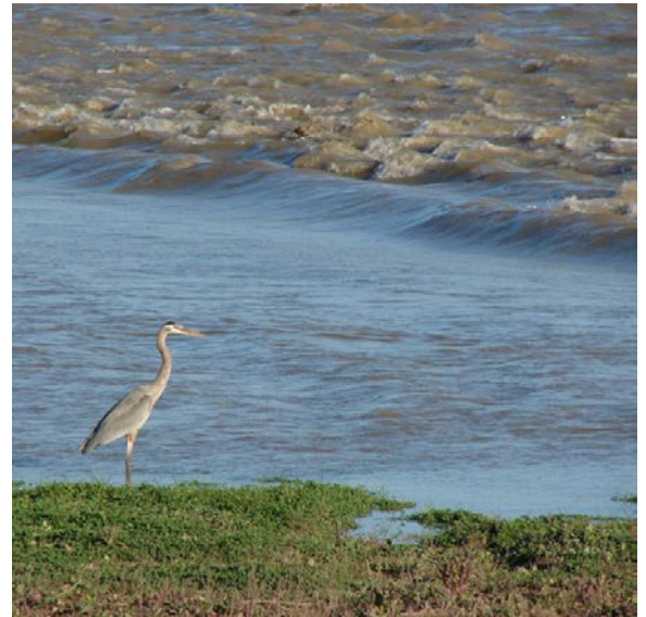
The Upper Chain of Wetlands will have the same look and function as the Lower Chain of Wetlands shown above during flood stage.

The Upper and Lower Chains of Wetlands combined will be 3.7 miles long with an average width of 600 feet. They will include about 271 acres of improved habitat of 45 acres open water, 123 acres emergent wetlands and 102 acres of grasslands. Working together they will provide a continuous pathway for floodwaters to travel from just below Moore Park all the way to Great Trinity Forest Way (Loop 12) where they rejoin the main channel.