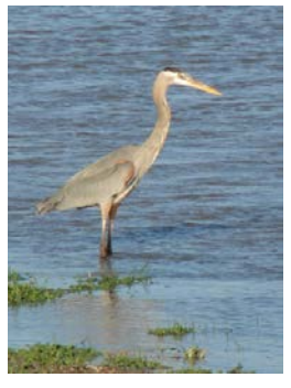
Great blue heron, 2012, Wetland Cell F

The wetlands are part of the Dallas Floodway Extension, one of two Corps of Engineers projects in partnership with the city of Dallas. The project footprint begins at the Santa Fe Trestle Trail and ends near I-20. Under a separate initiative, the Dallas Floodway Project, the Corps has proposed flood-risk reduction improvements to levees upstream of the Santa Fe Trestle trail and ecosystem restoration by returning the meander to the river, which was channelized in the 1920s when it was moved.