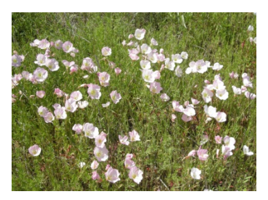
Pink evening primrose, April 2013, Wetland Cell F

Construction history: The federal project began in 2004 with the excavation of Wetland Cell D (next to the I-45 Trinity River Bridge); plantings began in 2005. Excavation of Wetland Cells E, E-West, F-North, F&G were completed in 2008 across a landfill and a golf course. Revegetation in this Lower Chain is complete. Excavation of the adjacent Upper Chain of Wetlands (Cells A, B&C) just upstream is under way with revegetation to follow. Completion target: 2018.