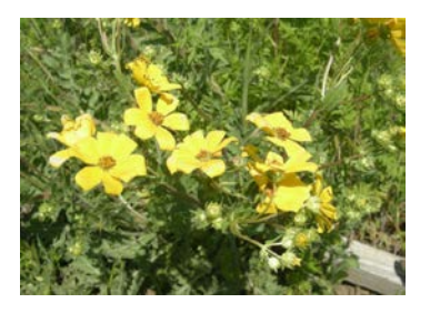
Engelmann's (cutleaf) daisy, April 2013, Wetland Cell F

<u>Project status:</u> The city of Dallas assumes management of the wetlands when the U.S. Army Corps of Engineers completes each section. It will be a public natural area for light recreational use (hiking, birding and bicycling).