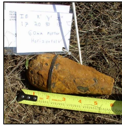
Munitions found at the former Camp Fannin.

Munitions may be rusty, colored or not, or in pieces.